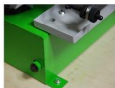
Collect nozzle and outlet nozzle