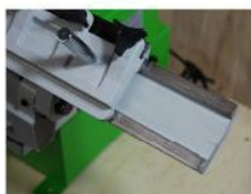
Knife rest sliding guide