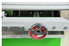
Moving stroke handle of knife frame