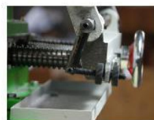
Knife rest adjusting device(Patent)