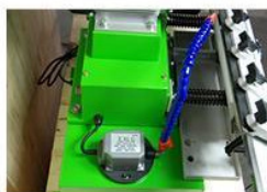
Enclosed water tank and water pump,water jet set