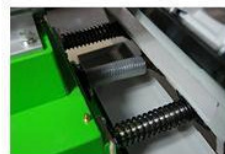
Knife moving screw